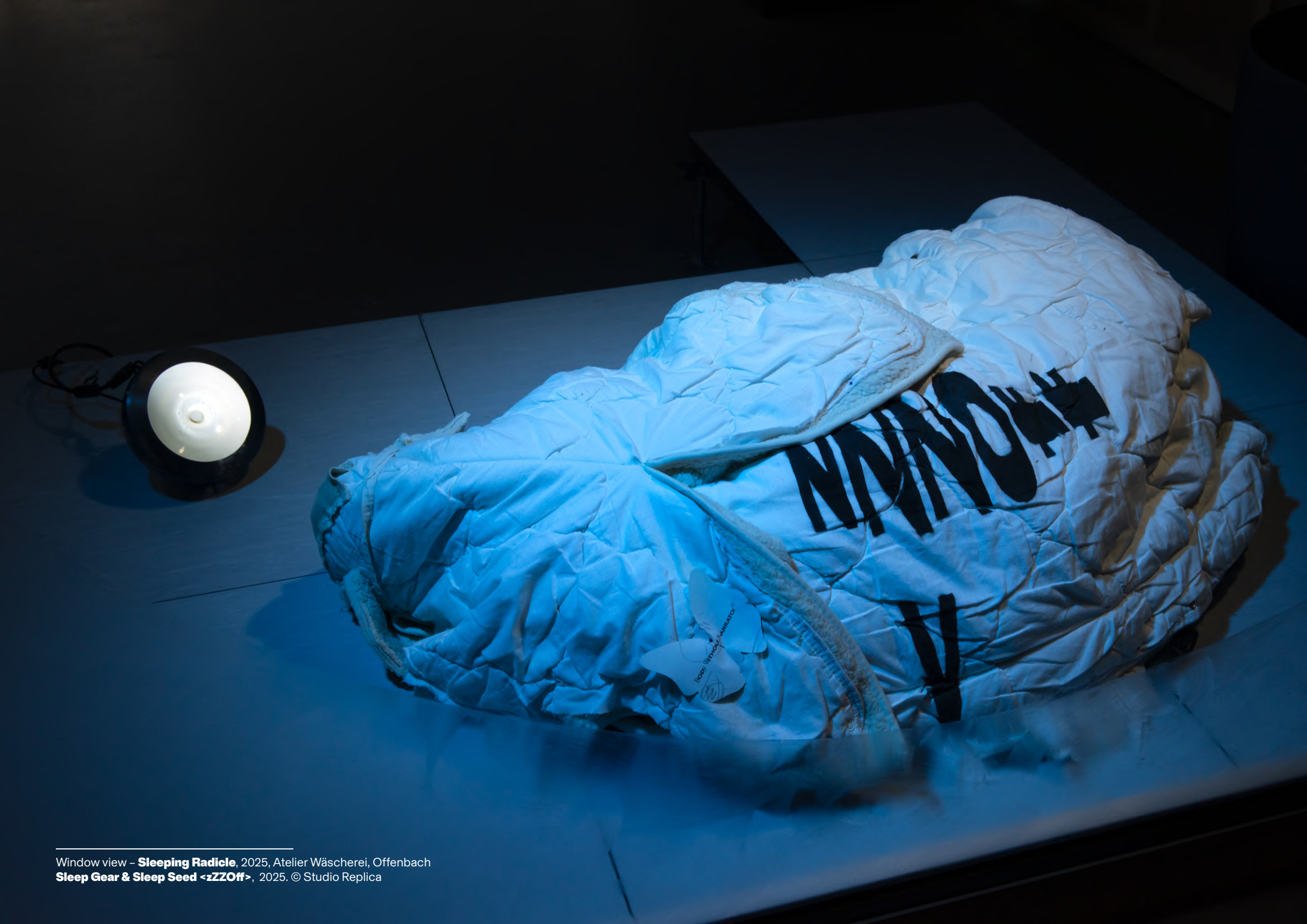
Window view - Sleeping Radicle , 2025, Atelier Wäscherei, Offenbach Sleep Gear & Sleep Seed <ZZOff> , 2025.