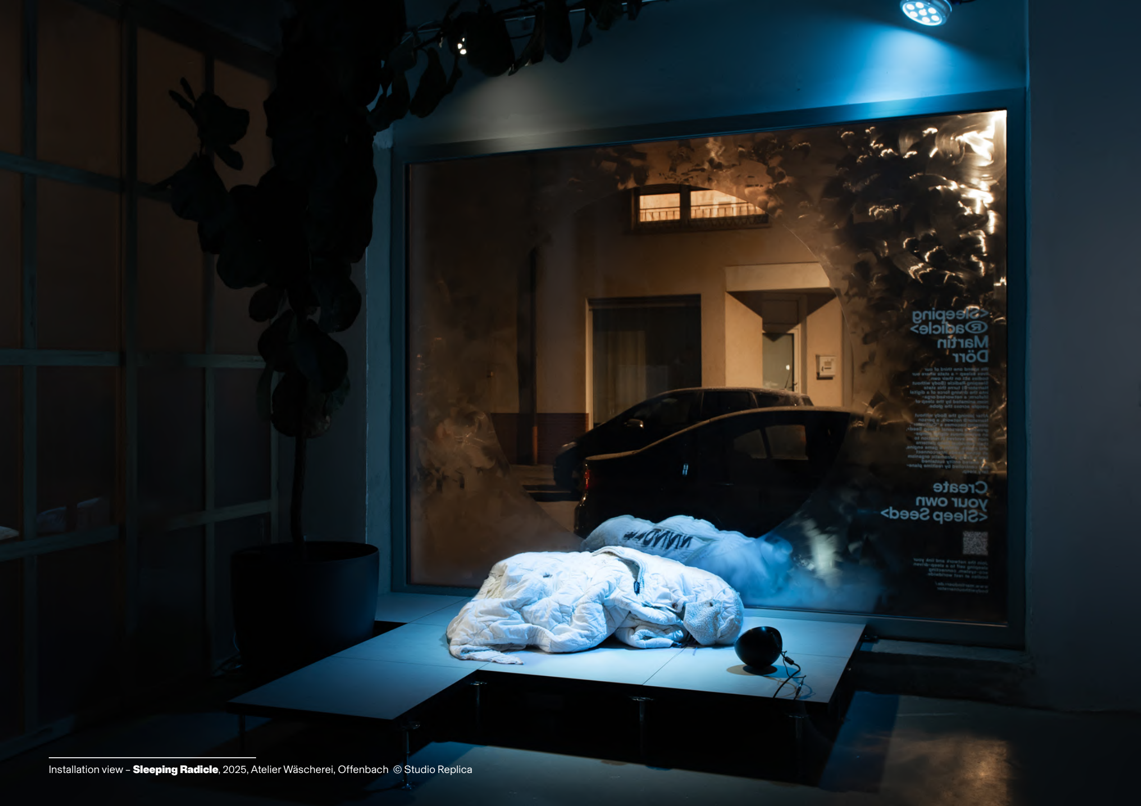
Installation view – Sleeping Radicle , 2025, Atelier Wäscherei, Offenbach