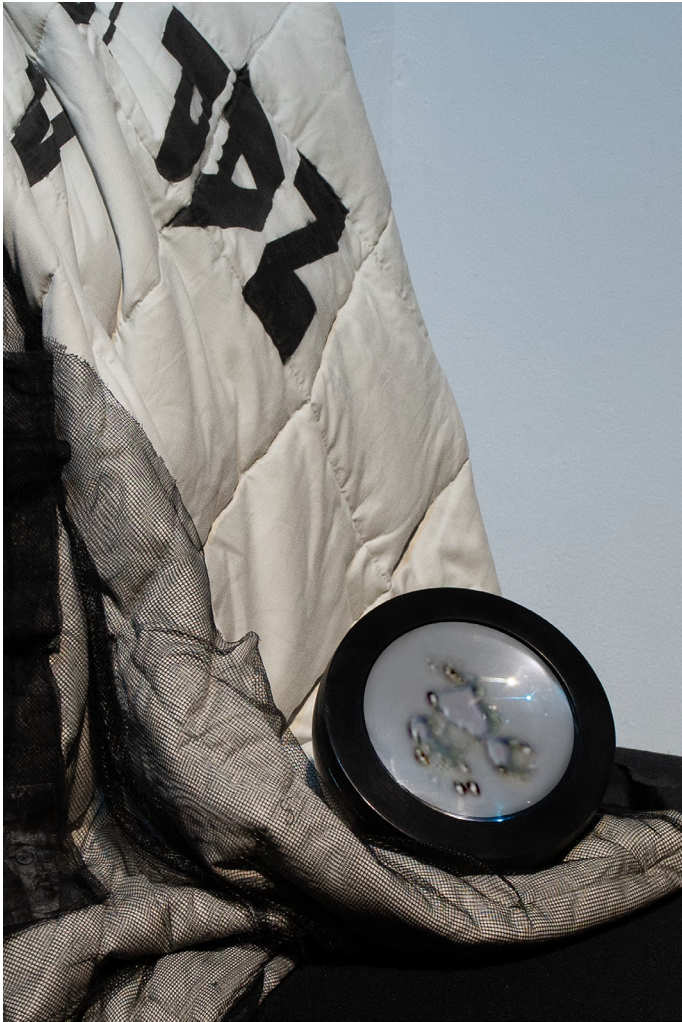
left: Detail – Sleep Seed <Nap_alone> Realtime simulation on Singular Seed Screen Circular 5" IPS Display (color, sound), 3D printed case, biconvex glass lens © Studio Replica right: Installation View– Sleeping Radicle , 2025 with Sleep Gear & Sleep Seed <Nap_alone> , 2025 Tired Clock , 2025 and Tired Ego , 2025 © Studio Replica